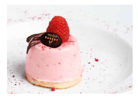
CampusravitaBakery's signature raspberry pastry