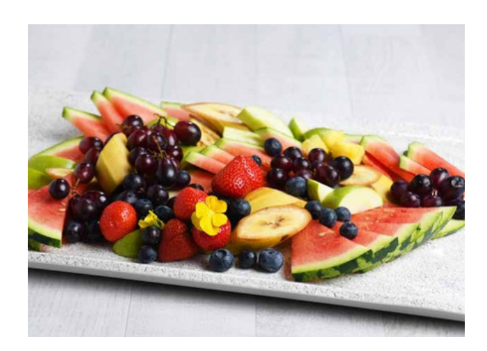
Freshly cut seasonal fruits and berries